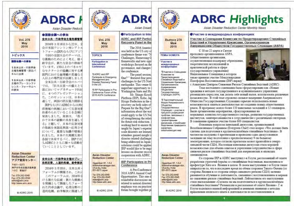
Fig. 3-2-5 ADRC Highlights (May 2016: Japanese edition, English edition, Russian edition)

ADRC has been using the Internet and e-mail to share information with its counterparts in the member countries, and other relevant parties. As one of its important tools for information dissemination, ADRC has been issuing the newsletter “ADRC Highlights” since 1 June 1999. It had been issued twice a month until FY 2007, and has been issued once a month since the renewal of its design in FY 2008.