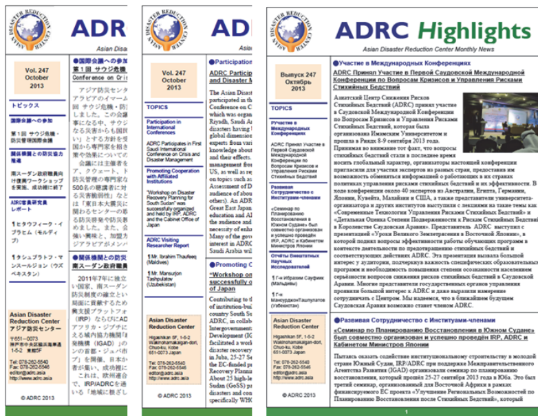
Fig. 1-4-3-1 ADRC Highlights (October 2013: Japanese edition, English edition, Russian edition)

ADRC has been using the Internet and e-mail to share information with its counterparts in the member countries, and other applicants. As one of its mainstay tools for information dissemination, ADRC has been issuing the newsletter “ADRC Highlights” since 1 June 1999. It had been issued twice a month until FY 2007, and has been issued once a month since the renewal of its design in FY 2008.