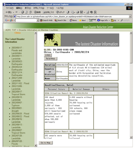
Fig. 2-3-3-1 Latest disaster info. page

ADRC developed a database and started to publish the latest disaster information webpage for contributing as a clearinghouse of disaster information from various sources in September 1998. The summarized information with direct link to the original information sources has been provided on the pages for the rapid search and access of information.