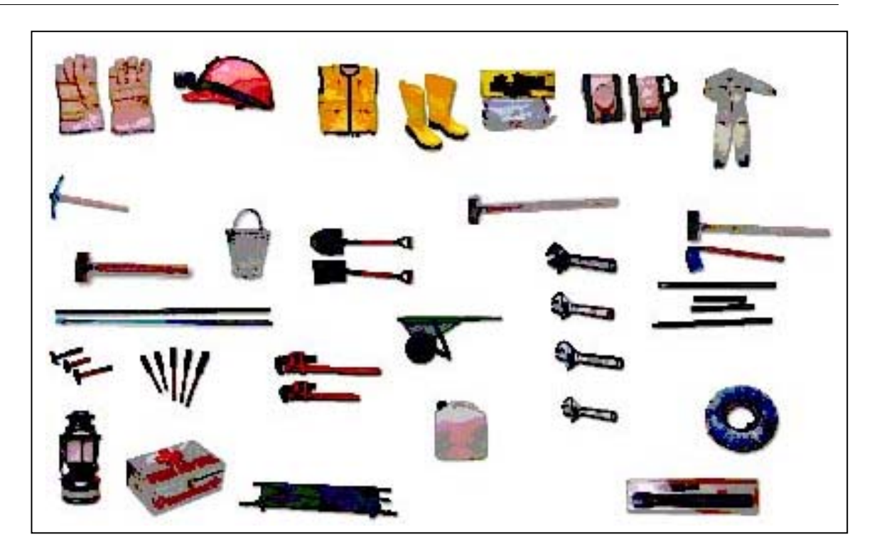
Figure 2: Typical Contents of PPERS items. There are ten numbers of each item.