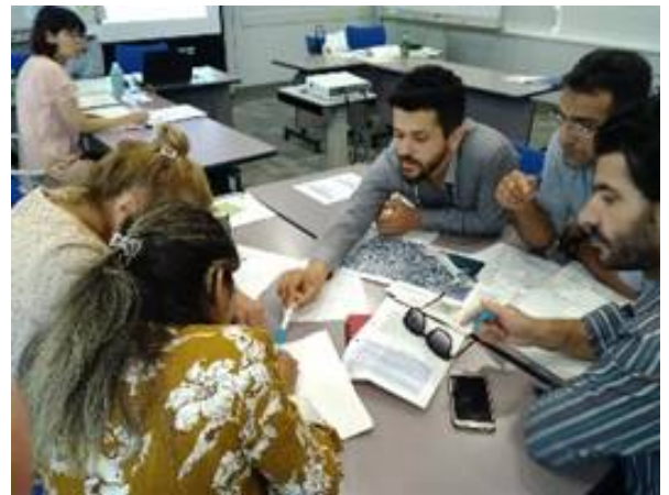
Workshop used educational tools for DRR studies

The training focused on practical approaches to teaching students about disasters and DRR in schools. Participants visited various schools, observed DRR lessons, and talked with teachers at schools including Takasago Elementary School and Hirose Junior High School in Sendai, Yuriage Compulsory Education School in Natori, and Maiko High School and Kobe Kindergarten in Kobe. Further, they learned how educational tools and materials, such as card games, practical exercises, and picture stories, can be used in DRR education. The participants recognized the effectiveness of active and practical learning for DRR.