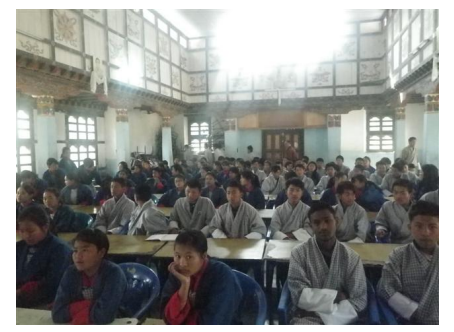
Junior high school students

DDM indicated its intent to conduct this activity not only in the Punakha area but throughout Bhutan. ADRC and Plus-Arts gave most of the related materials to the DDM, asking that such activities be further promoted and that photos and simple reports from those events be provided. ADRC has high hopes for these efforts to strengthen the disaster reduction capacity of Bhutan.