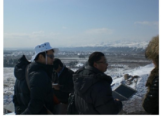
Field Survey in the Peer Review

We hope that efforts to promote landslide risk reduction in Tajikistan will be further developed based on the experience and information gained through these project activities and the Peer Review. ADRC would like to express its sincerest gratitude to all those who contributed to this year's project.