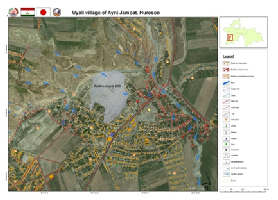
One of the developed hazard maps in the target area

The ADRC Cooperative Project for Promoting the Implementation of the HFA was conducted to provide support to the governments of ADRC member countries to help them strengthen their commitment, expand resources, and make further progress toward the expected goals of the HFA. The ADRC called for project proposals from the member countries, and after careful screening, selected the proposal from Tajikistan to be conducted in fiscal year 2011. To ensure the effective implementation of the project, it was decided that a Peer Review like the one conducted last year should be conducted over the course of the project's implementation.