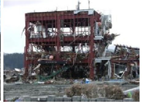
Disaster management center of Minami-Sanriku (2011.3.23)