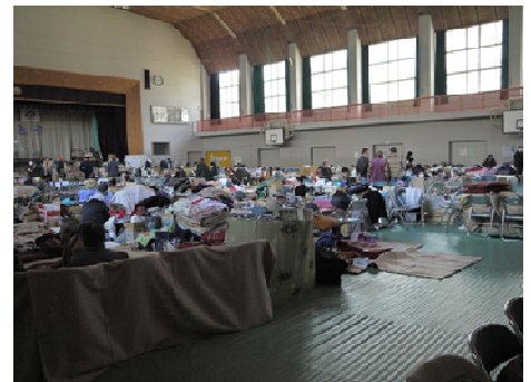
Evacuation center in Minami-Sanriku (2011.3.23)

The government is also preparing supplementary budget proposals for deliberation in the Diet, which are reported to propose the allocation of more than 10 trillion yen to disaster-related efforts. It is also reported that the government is examining a plan to relocate residents of tsunami-hit areas to higher ground, where new communities can be built, and to purchase the areas totally devastated by the tsunami, since these will not be suitable for the rebuilding of communities.