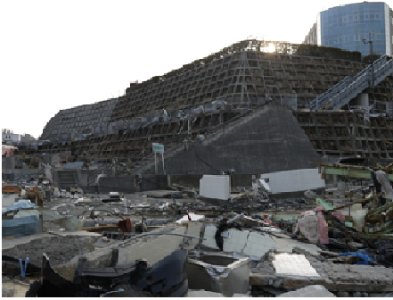
The evacuation route to Onagawa Municipal Hospital (2011.3.22)