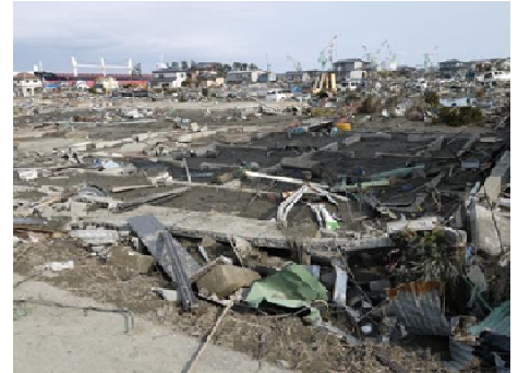
The coastal residential area of Higashi-Matsushima city (22 March 2011)