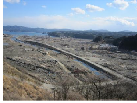
Panoramic view of Minami-Sanriku (2011.3.23)