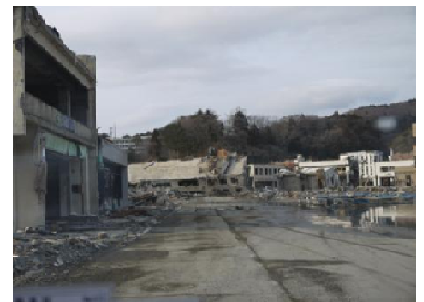
The coastal area of downtown Onagawa (2011.3.22)

The disaster management center of Minami-Sanriku, a three-story building, was designed to function as a tsunami evacuation building. When the tsunami struck, about 30 municipal officials evacuated to the rooftop, but only 10 survived. A young official who kept delivering evacuation notices to the villagers until the very last moment has yet to be found. It was generally believed that three-story reinforced concrete buildings could be designated as evacuation buildings, but such structures provided insufficient protection during this disaster.