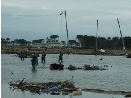
Search activities in Arahama district, Wakabayashi ward (22 March 2011)

Ishinomaki city, the second largest city in Miyagi prefecture (population: 170,000), has a port, a fishing port, and factories owned by such companies as Nippon Paper Industries Co., Ltd. The city's downtown area sustained massive damage as a result of the tsunami and resulting fires, which caused many casualties. The coastal residential areas of Higashi-Matsushima city, which is located next to Ishinomaki, also sustained massive damage.