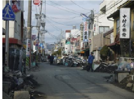
The downtown area of Ishinomaki city (22 March 2011)