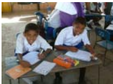
Children filling in the survey sheets (Habaraduwa)

From 1 to 14 March 2005, ADRC conducted a field survey on awareness of disaster risk in Galle district, southern part of Sri Lanka, in order to identify current situation and characteristics of community's capacity to respond to natural disasters. The survey was conducted for the purpose of proposing strategy