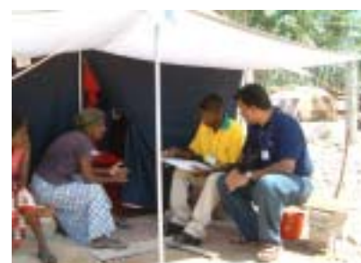
Interview to the affected people living in the tent (Hikkaduwa)

Through the survey, the current situation regarding the capabilities and awareness of residents and school children in disaster reduction was illustrated. It was also found out that a number of local