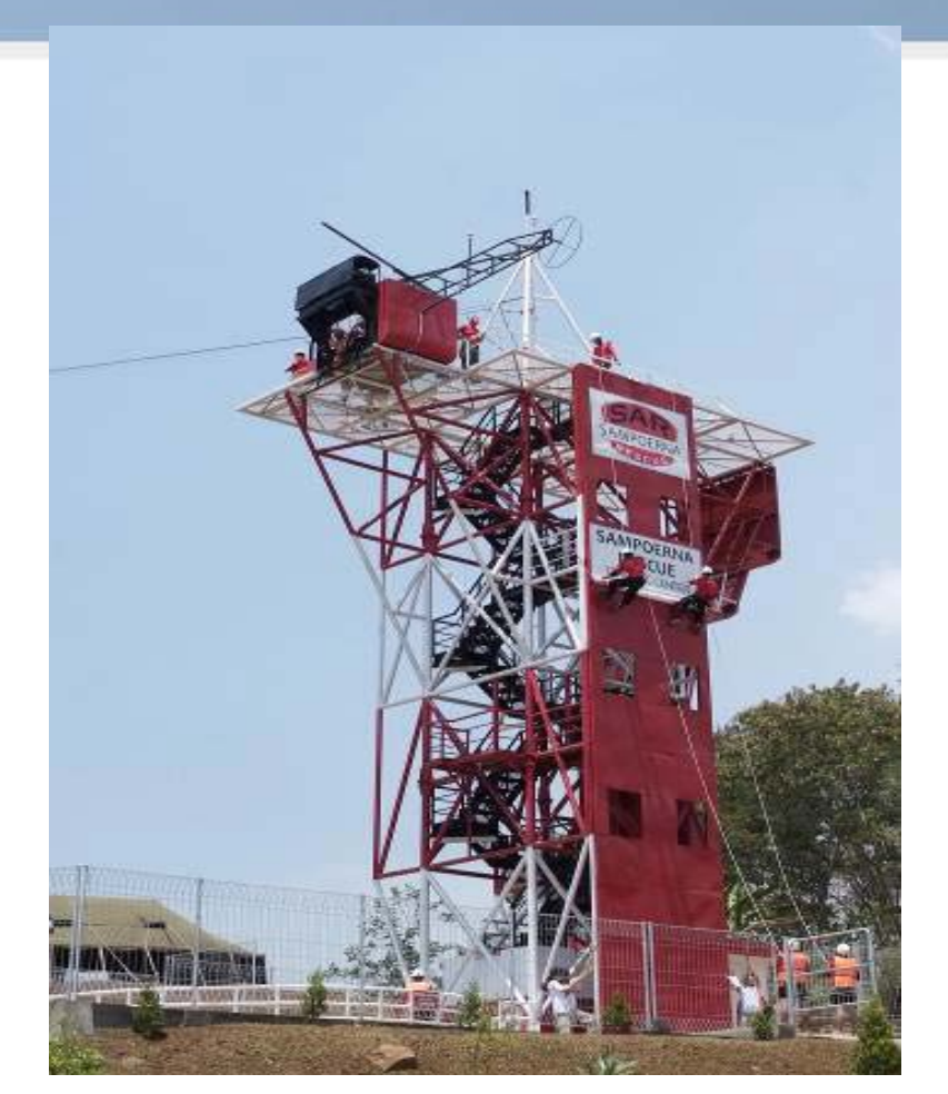
One of Training Facilities at Sampoerna Rescue Training Center (SAR-TC) in Pandaan - Pasuruan