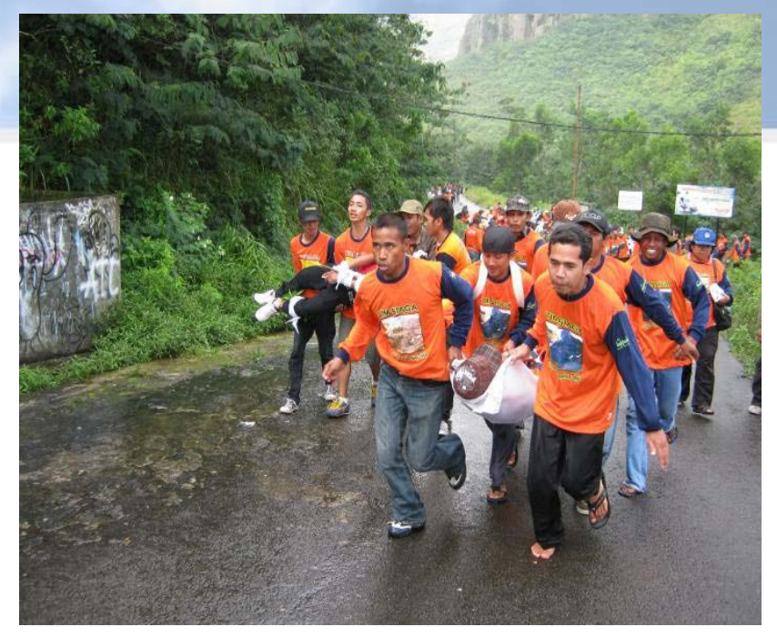
Simulation of early warning and evacuation