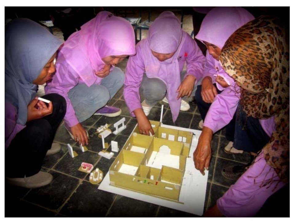
Workshop of safe spatial planning for village cadres

Sukanagara residents, Sukanagara Subdistrict, Garut Regency were participating in the process of village map making, which contained disaster hazards in that village