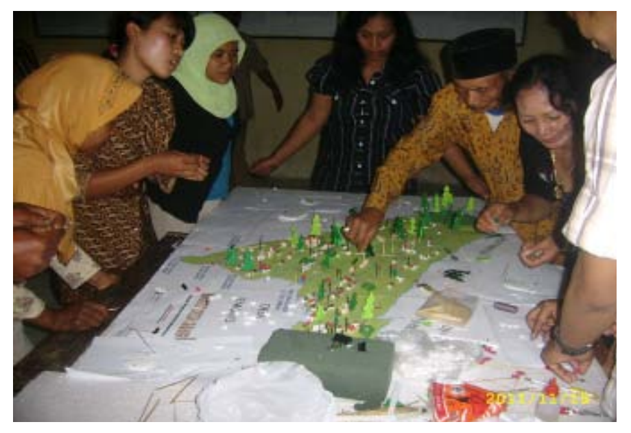
Map and Mockup was very helpful in making decision process