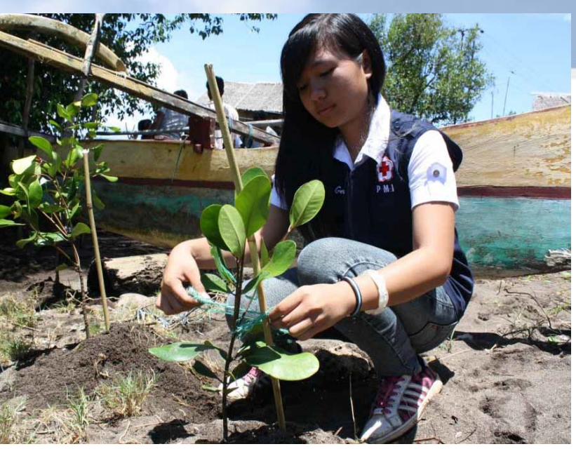
PMI Activities to plant mangrove as the effort of mitigation