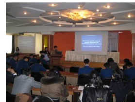
Lecture on Japanese EQ Management