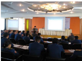
Lecture by Mongolian Experts