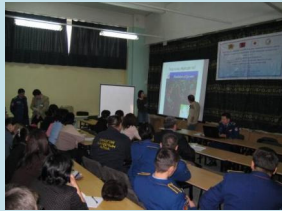
Lecture on EQ Mechanism

Date: 15 Feb. (School No.20) & 16 Feb. (School No. 5) 2011