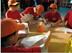
Making a dish using newspaper

Date: 17 Feb. (School No.20) & 18 Feb. (School No. 5) 2011