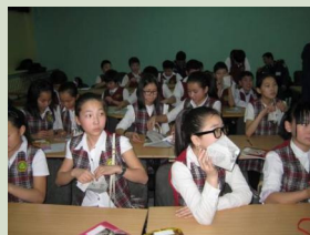
Lecture on Japanese EQ Management