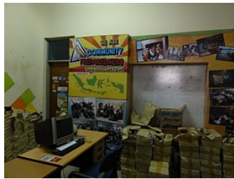
Promotion items for CBDM