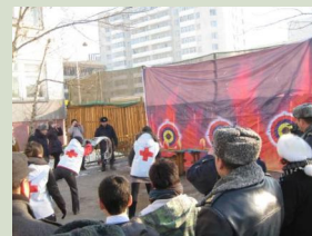
Exercise for Fire Extinguishing