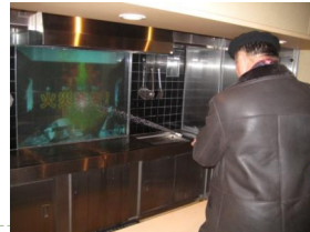
Visit to Disaster Management Center for Public Education