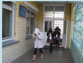
Evacuate protecting head