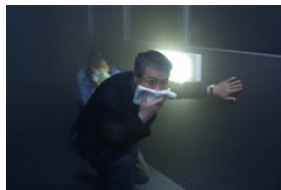
Smoke Maze Section