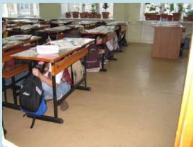
Hide themselves under desks

Date: 17 Feb. (School No.20) & 18 Feb. (School No. 5) 2011