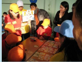
DM Card Game “Catfish School”