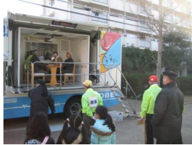
Experience of Shaking-Table Car