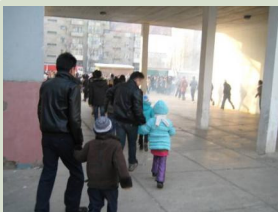
Evacuate with small grade students