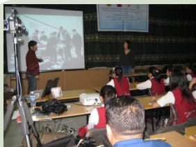
Lecture by Mongolian Experts