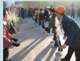
Bucket Relay for Fire Extinguishing