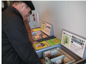
Visit to the Great Hanshin Awaji Earthquake Museum