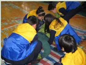
Blanket Stretcher Time Trial