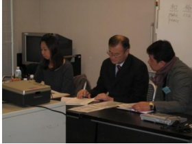
Lecture on Disaster Prevention Education of Kobe Municipality