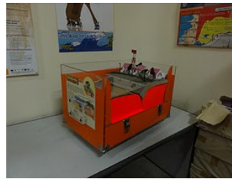
Model of plates and earthquake in LIPI