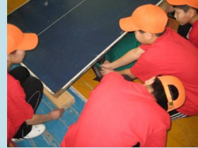
Jack Lifting Exercise