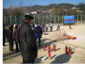
Observation of Community DM Drill