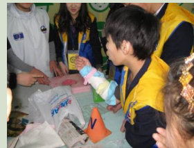
First Aid Training using the items around you