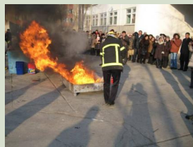
Demonstration of Fire Extinguisher