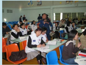
Lecture on DM Activities