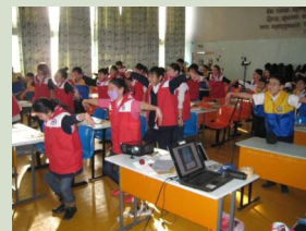
Lecture on Japanese Disaster Prevention Education