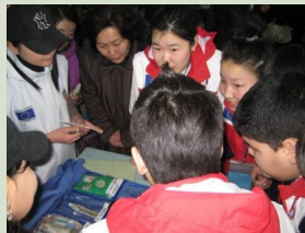
Emergency Kit Quiz