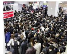
3.11 railway station in Tokyo