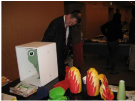
Participation in the "Iza! Kaeru Caravan Workshop