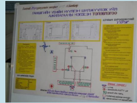
Discussion on Evacuation Plan