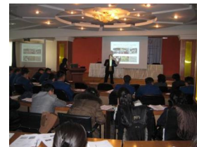
Lecture on Japanese Disaster Prevention Education