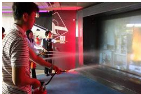
Fire Fighting Training Section