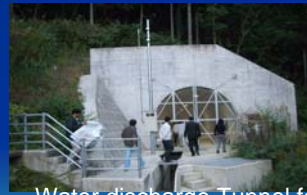
Water discharge Tunnel for landslides protection, Shikoku, Japan