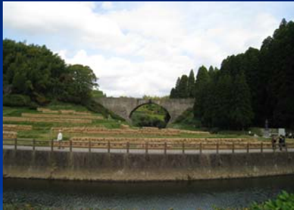
Stone Irrigation Bridge Against Famine, built in 1854 Kumamoto, Japan