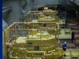
The Metropolitan Area Outer Underground Discharge Channel, flood control facility, the Edogawa River, Saitama, Japan