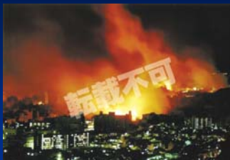
Great Hanshin-Awaji Earthquake, 1995