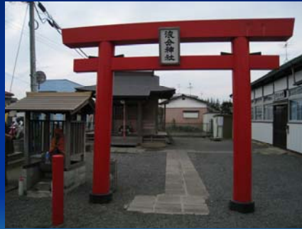
Tsunami memorial Temple, Sendai (Jogan Tsunami, 869) Japan