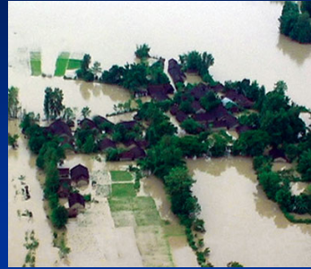
Flood in Nepal, 2008