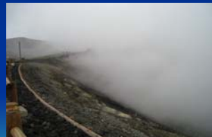
Active Volcano Crater, Kumamoto, Japan