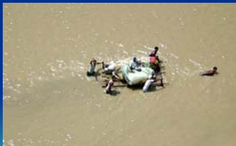
Flood in Nepal