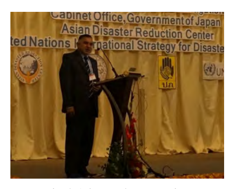
Fig. 2-1-3. Nepal Presentation at ACDR2016

ADRC also supported to strengthen DRR capacity at community level through two JICA technical cooperation projects. The first one is to promote disaster education and the establishment of early warning system for the village facing high risk of landslides in Gorkha and Sindhupalchowk district, main affected area by the earthquakes. The other one aims at disaster education for