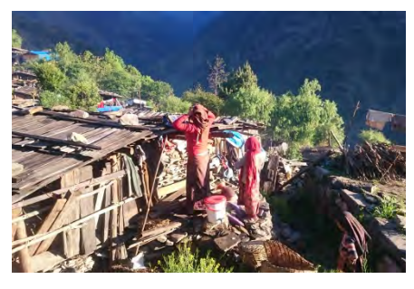
Fig. 2-1-2. Temporary shelter in Laplak VDC

The affected areas are largely mountainous, where majority of residents engages in agriculture at the slopes originally developed by landslides. They had lived in wooden and brick houses without consideration of seismic resistance. After the disaster, blue sheets or Corrugated Galvanised Iron (CGI) sheets provided, and the timbers taken out from the rubbles are used for making the temporary shelters by themselves.