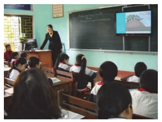
Fig. 4-4-2 Pilot Class (Vietnam)