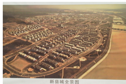
Panorama of the new town