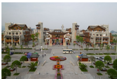
New Beichuan Town

This area was chosen because it has a fewer disaster risk being located on the flat ground in the Sichuan basin and also it may have possible economic effects from big cities located close to the town. The town is zoned into commercial district, public office district, industrial district, and residential district where condominiums with colorful design stand in rows. 30,000 people already live in this town.