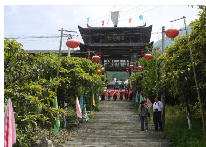
Entrance gate of Shiyi village