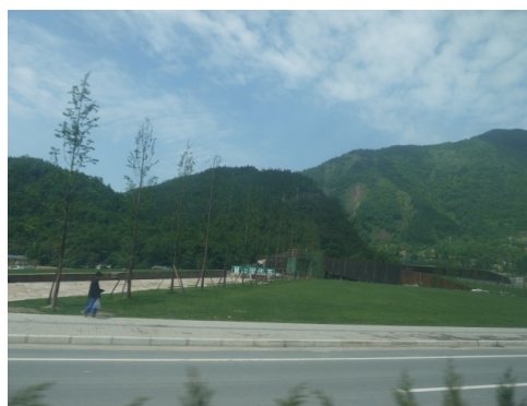
The Beichuan Earthquake Museum (under construction)