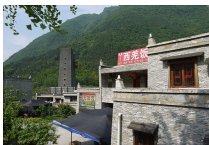
Houses and a crow's nest of Jina village

This is another small village for Beichuan Qiang family (91 households) located on the highlands in the steep slopes of the mountain. Many houses of this town were severely damaged by the earthquake. After the earthquake, the affected families founded the company jointly and started operating business of overnight stay tourism called 'nongjiale' utilizing the traditional culture. They are now attracting a lot of tourists.