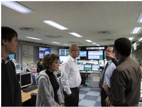
Fig. 4-1-3-1 [Armenia] Visit to Japan Meteorological Agencycenter