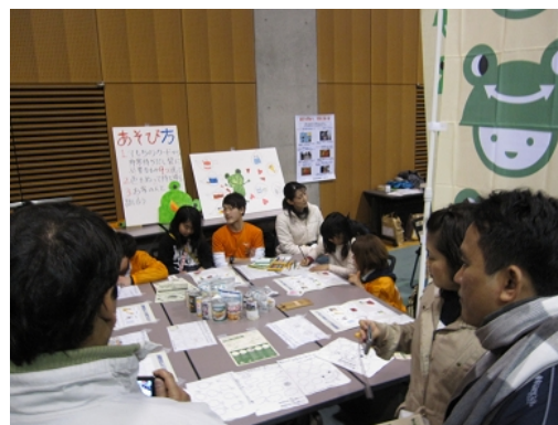
Fig. 4-1-3-8-1 [Philippines] Participation in Disaster Awareness Event, Kaeru Caravan