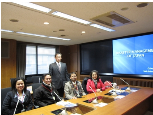
Fig. 4-1-3-5 [India] Visit to Cabinet Office of Japan