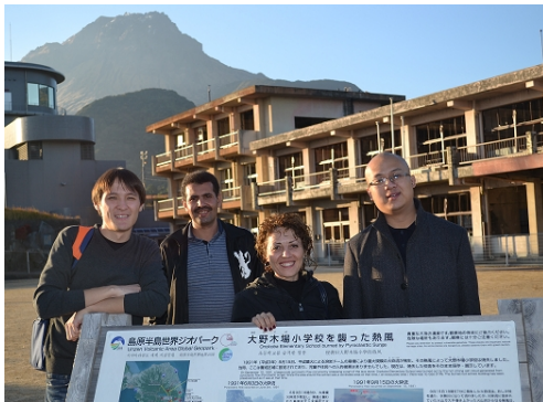
Fig. 4-1-3-3 [Kyrgyz Republic] Visit to a school affected by volcanic eruption, Nagasaki