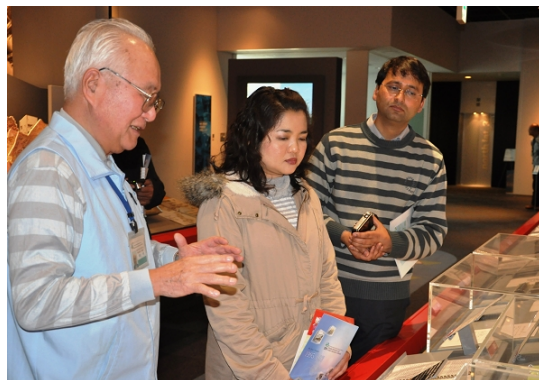
Fig. 4-1-3-6 [Indonesia] to Disaster Reduction and Human Renovation Institution