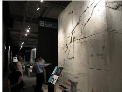
Fig. 4-1-3-2 [Yemen] Visit to Hanshin Expressway Earthquake Museum