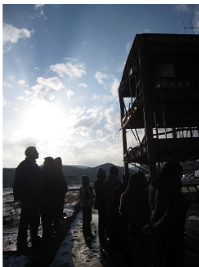
Fig. 4-1-3-7-1 [Thailand] Visit to the Great East Japan Earthquake affected sites