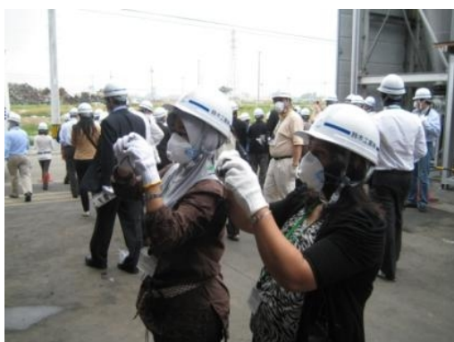
Fig. 4-1-3-3 [Philippines] Visit to the Affected Areas by the Great East Japan Earthquake