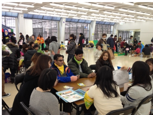
Fig. 4-1-3-5 [Thailand] Participation in the Public Awareness Event