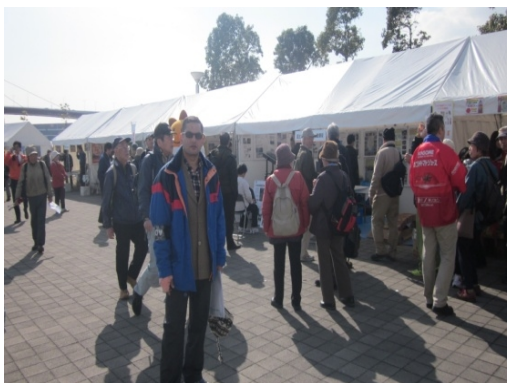
Fig. 4-1-3-6 [Nepal] Memorial Event of the Great Hanshin-Awaji Earthquake