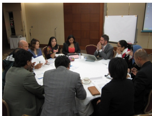
Fig. 4-1-3-8-1 [Mongolia] Participation in the International Recovery Forum