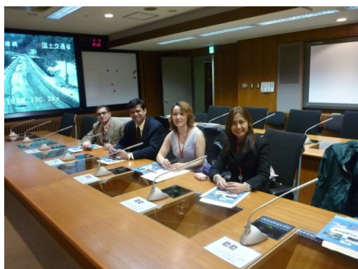
Fig. 4-1-3-7-1 [Bangladesh] Visit to Cabinet Office Japan to learn DRM System