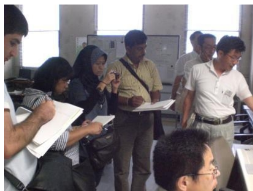
Fig. 4-1-3-2 [Sri Lanka] Visit to Himeji Water Utilization Office, Hyogo Prefecture