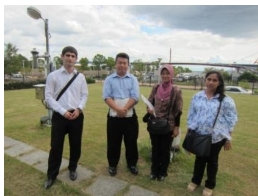
Fig. 4-1-3-4 [Malaysia] Visit to Kobe Marine Observatory