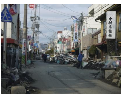
The downtown area of Ishinomaki city (22 March 2011)