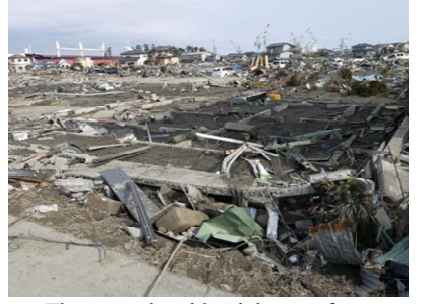
The coastal residential area of HigashiMatsushima city (22 March 2011)