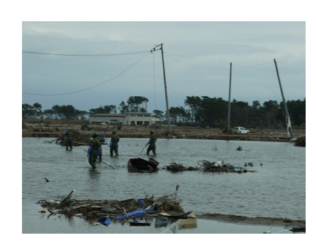
Search activities in Arahama district, Wakabayashi ward (22 March 2011)

Ishinomaki city, the second largest city in Miyagi prefecture (population: 170,000), has a port, a fishing port, and factories owned by such companies as Nippon Paper Industries Co., Ltd. The city's downtown area sustained massive damage as a result of the tsunami and resulting fires, which caused many casualties. The coastal residential areas of Higashi-Matsushima city, which is located next to Ishinomaki, also sustained massive damage.