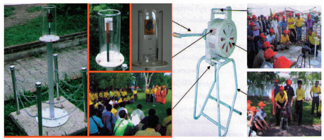
Simple Rainguage, Manual Siren and "Mr. Warning" Training Course

Since the inception in August 2006, DDPM in collaboration with the earlier mentioned government agencies, has launched this training course in floods and landslides in villages of 51 provinces (out of 76 provinces) nationwide. A total number of 6,455 "Mr. Warning" have been designated and appointed as the "village-based disaster warning volunteers" in their respective villages.