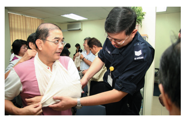
CEPP Training on First Aid

Force. Through this training programme, the SCDF will train intakes of about 25,000 SAF and SPF officers on an annual basis. The components of CEPP will be taught to these regular officers and national servicemen as part of their Basic Military Training at Basic Military Training Centre, Basic Police Training at Home Team Academy and on-going in-service training at various SAF and Police units. A total of 220,590 participants have benefited from this programme since it was launched on 22 September 2003.