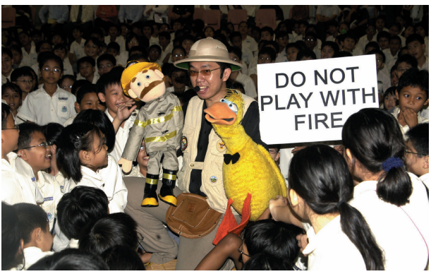
Fire Safety Puppet Show

9. The student population is also not neglected in the effort to prepare them for emergencies. Dedicated Liaison Officers from nearby fire stations are assigned to 177 primary schools to conduct awareness talks, support exhibitions and demonstrations, facilitate visits to fire stations, as well as assist in school emergency planning and exercises. As part of SCDF's collaboration with the NFPC in promoting fire safety education in schools, the Fire Safety Puppet Show for primary students and Fire Safety Drama for secondary students are held in addition to providing CD-ROM on fire safety and large-size picture story-book to be used during story-telling time at the school library. About 35,000 Secondary 3 students are also trained in CEPP every year. Since the introduction of the National Civil Defence Cadet Corp (NCDCC), 25 secondary schools have participated in the scheme. Students in uniformed groups such as the Boys' Brigade, St John's Ambulance Brigade, Red Cross etc are also taught emergency procedures.