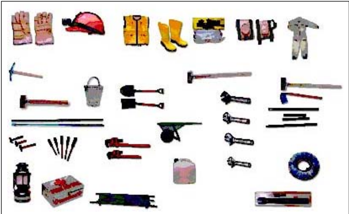
Figure 2: Typical Contents of PERS items. There are ten numbers of each item.