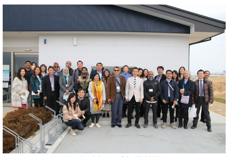
Participants of the Field Trip

The participants then walked along the Teizan Canal and the reconstruction public housing area, where they were able to directly see and learn how the land level was raised and tsunami emergency evacuation sites were set up in public housings.