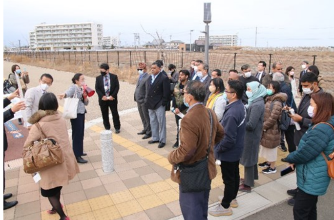
Teizan Canal and the reconstruction public housing area

We would like to thank once again to all those who supported with us on this field trip and those who participated in ACDR2022.