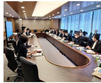
Japan Broadcasting Corporation (NHK)