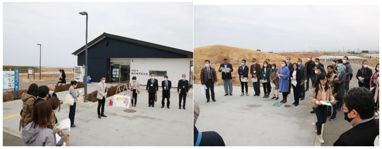
Explanation by the Mayor of Natori City, Mr YAMADA Shiro in front of the Earthquake Reconstruction Museum

At the Earthquake Reconstruction Museum, the participants divided into two groups and received an explanation from the Mayor on the overview of the recovery situation of the area and the facility's function as a flood defence facility at the time of emergencies. In particular, the explanation of the post-disaster town planning attracted a lot of interest, as it talked about how the population declined immediately after the earthquake and tsunami event, and how it turned to increase after the promotion of the new town planning.