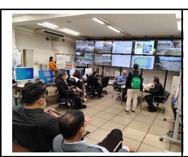
Kofu Work Office, Kanto RDB, MLIT

Asian Disaster Reduction Center (ADRC) supported the delegation by advising on the development of its agenda and by accompanying the delegation on the study visits.