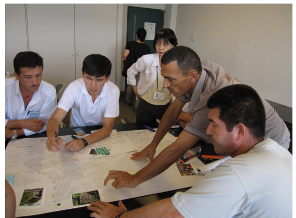
[Town Watching Program]

Central Asia and the Caucasus frequently experience disasters such as floods, droughts, landslides, and earthquakes, some of which extend across several countries. Also, heavy snowfall in the winter can lead to flooding when mountain glaciers thaw in the warmer seasons. Thus, these regions have common concerns in terms of disaster risk management. It is hoped that the participants will make good use of the knowledge, technologies, and methods they learned from the training course to implement various projects and help strengthen the disaster management systems in their home countries. This course also allowed participants to reinforce their relationships with one another, and is expected to strengthen disaster management information networks in the region. ADRC would like to express its sincerest gratitude to all the organizations that contributed to the success of this course.