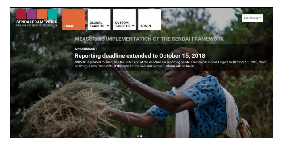
Sendai Framework Monitor (sendaimonitor.unisdr.org)