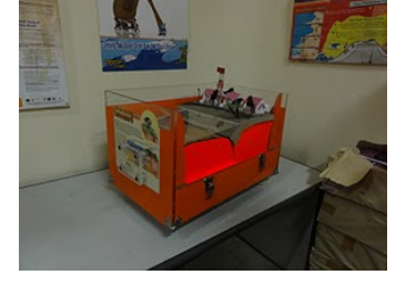
Promotion items for CBDM