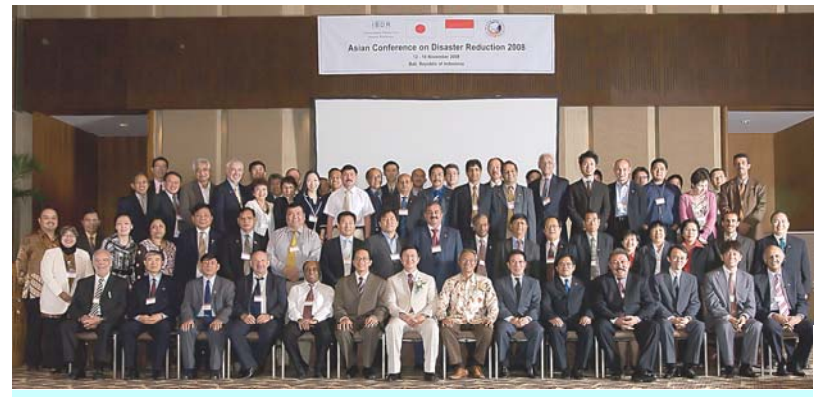
The Asian Conference on DR 2008