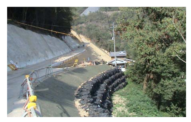
Road Construction: New route 32 "Inohana" Road River Bank construction, Yoshino River

River Bank & Road Construction Site, and Landslide Protection and Sameura Dam in the Yoshino Valley (Shikoku Island)