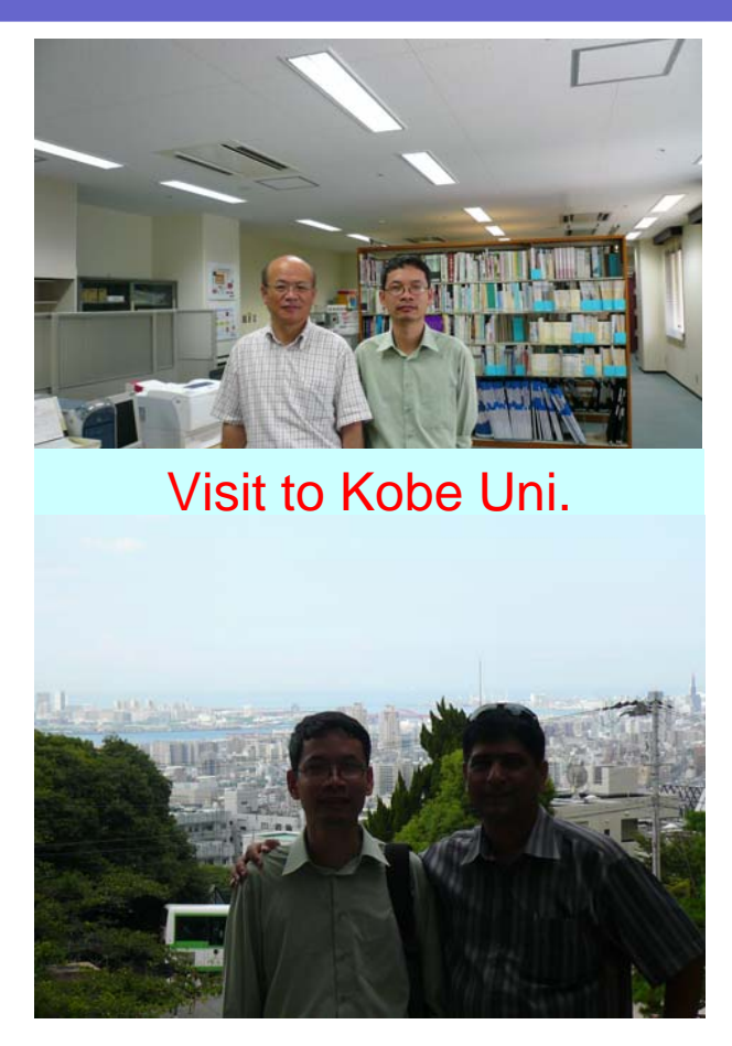
Kobe University Library