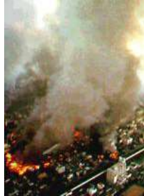
The damage and loss caused by the great earthquake in Hyogo Prefecture